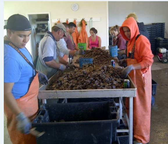
Indian Island, grading oysters