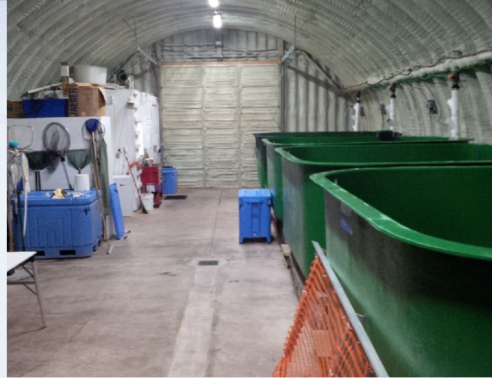
Abegweit, salmonid hatchery