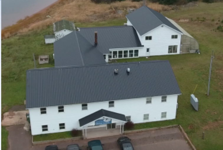
Bideford Shellfish Hatchery – Lennox Island