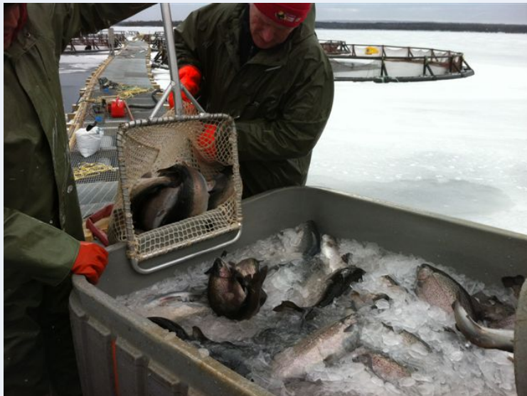
Waycobah, harvesting trout